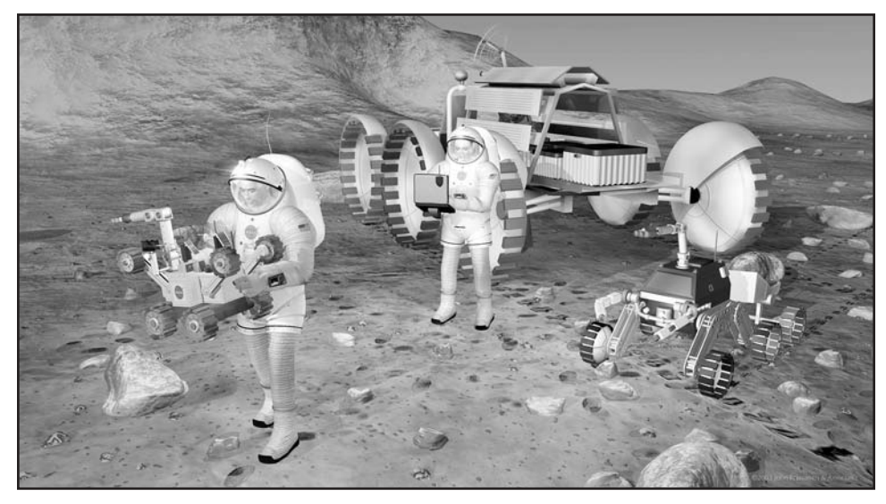
An artist's rendering of crew members setting up equipment during a Mars polar expedition.

of existing assets and emerging capabilities." The Commission also recommended that NASA ask the National Academy of Sciences (NAS) to "engage the scientific community in a re-evaluation of priorities to exploit opportunities created by the space exploration vision," particularly the effective use and scientific value of human, robotic, and combination missions. The Commission also recommended that NAS, with the help of the scientific community, develop metrics for the selection of future destinations in space, taking into account "affordability, technical maturity, scientific importance, and emerging capabilities including access to in-situ space resources."