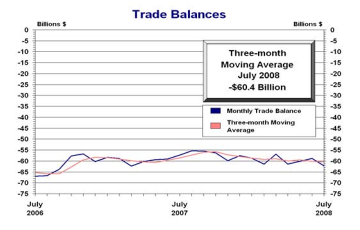
$1.1 ($1.8), Singapore $0.9 ($1.5), and Egypt $0.5 ($0.4). Deficits were recorded, in billions of dollars, with China $24.9 ($21.4), OPEC $24.2 ($18.1), the European Union $11.0 ($8.2), Canada $8.3 ($7.2), Japan $6.3 ($6.1), Mexico $5.5 ($5.7), Venezuela $5.4 ($4.6), Nigeria $3.8 ($3.3), Korea $1.3 ($0.5), and Taiwan $0.5 ($0.6).

The July figures showed surpluses, in billions of dollars, with Australia $1.2 ($1.0 for June), Hong Kong