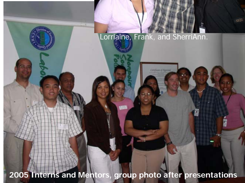
2005 Interns and Mentors, group photo after presentations