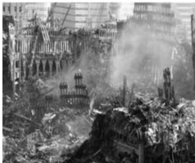
World Trade Center Towers Complex, September 11, 2001

I began to wonder exactly what I got myself into by volunteering for this temporary duty assignment. For me,