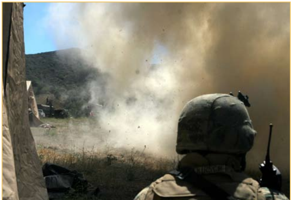
Simulators create battlefield conditions during training.

Based on annual average usage numbers and the amount of perchlorate in the previous formulation, this project has reduced the amount of potassium perchlorate utilized on ranges and in Army ammunition plants by up to ten tons per year, benefiting Soldiers and surrounding communities by greatly reducing the potential for perchlorate exposure. In addition to reducing perchlorate used in the M115A2 and M116A1 simulators, the Perchlorate Replacement Team strives to identify other potential horizontal integration opportunities for these perchlorate-free formulations. RDECOM is directly leveraging this research to develop perchlorate replacements in other weapon systems including the M117/M118/M119 Family of Booby Trap simulators and the M274 Smoke Signature Practice Warhead for