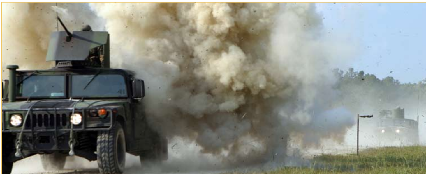
Four M116A1 Simulators Mimic an IED Attack on a convoy.