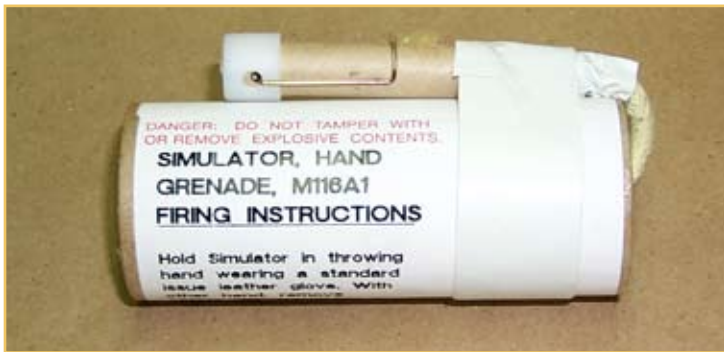
The M116A1 (shown) is a 4" tall cylinder - roughly the size of a deck of cards.

To date, EPA has detected perchlorate in groundwater in at least 34 states. Several states have been proactive in regulating perchlorate by developing a maximum contaminant level (MCL). The MCL for California is 6 ppb and the MCL for Massachusetts is 2 ppb. These regulations are much lower than the recommended federal guidance of 24.5 ppb and could impact the use of perchlorate-containing munitions in these states. Although current federal regulations do not exist today, perchlorate may be regulated under the federal Clean Water Act in the future. The Office of the Secretary of Defense Emerging Contaminant Directorate placed perchlorate on the Action List because continued use of perchlorate has significant potential impacts to human health and the environment as well as the DoD mission.