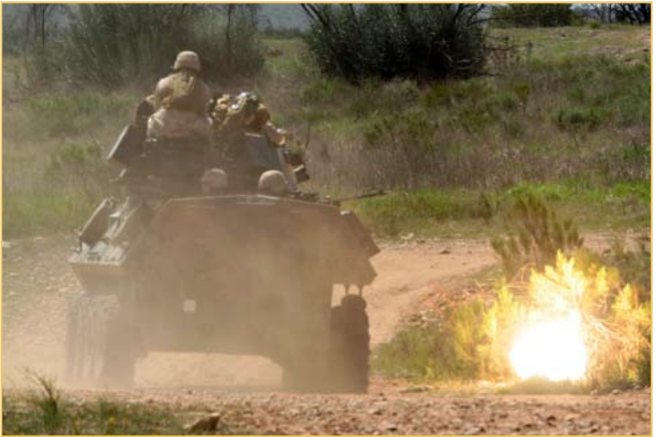
M116A1 used to simulate IED attack.

The manufacturer (Pyrotechnique by Grucci) played an integral role in assessing feasibility and producibility of the candidate materials. Grucci was involved from the start of the program and provided input into material development. The Grucci manufacturing facilities at Radford Army Ammunition Plant produced all limited scale production runs used in the testing and demonstration of the perchlorate-free simulators. In addition, Grucci hosted several IPRs, production plant tours and functional tests at their facility.