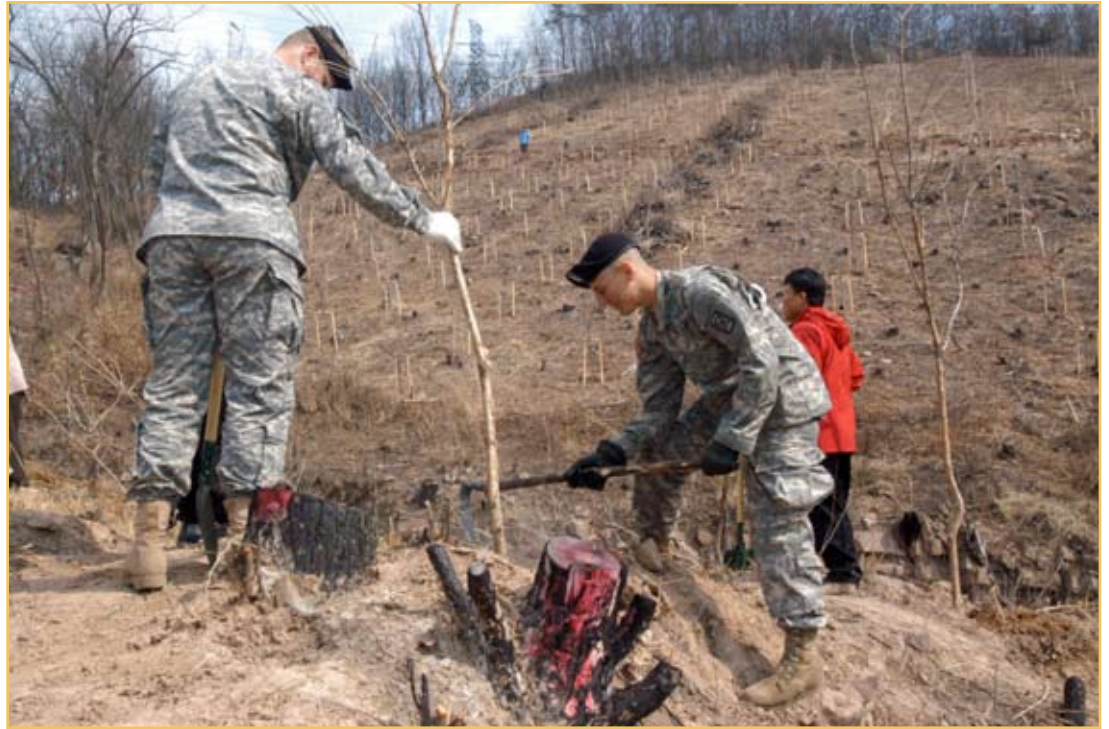
Soldiers, Civilian workers and family members from throughout USAG Daegu participate in a mass tree planting event on Waryong Mountain in Daegu Korea celebrating Arbor Day.

members, civilian employees and the and Boy Scouts. Week-long Earth Day events included partnering with the Army Community Services Youth Center to provide field trips of the Camp Carroll Wastewater Treatment Plant. Information kiosks were set up and staffed at the Camp Walker Post Exchange and the Camp Carroll Community Activities Center. In-classroom instruction was also provided to the School Age Services program discussing the importance of recycling and caring for the natural environment.