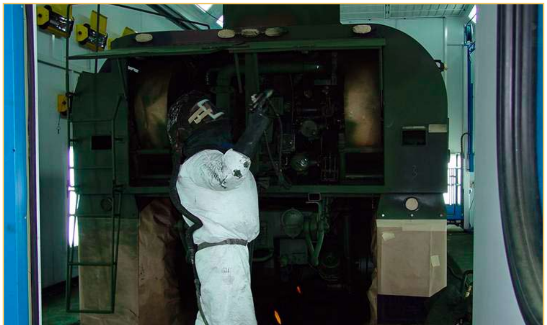
US Army Material Support Center Korea Korean National employee uses the new water-based CARC paint application system.

Use of the HAZMART facility by the Environmental Quality Team to track hazardous material usage, to reissue excess hazardous materials, to conduct shelf-life extension activities, and to operate an antifreeze recycler saved valuable mission unit resources for use in other priority efforts. Hazardous materials management averaged $382K cost savings per year in FY 2006/FY 2007. The shelf-life extension program realized a cost avoidance of approximately $300K and recycling used antifreeze saved $74K in disposal costs. Additional savings will be realized due to hazardous waste management projects that were established in FY 2007: two hazardous waste