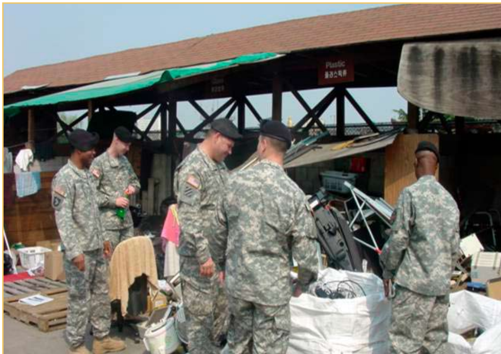
Soldiers attending the Environmental Compliance Officer Course visit the Camp Walker recycle point.

USAG Daegu's mission is to provide responsible management of affiliated installations, support mission readiness and execution, ensure the well-being of Soldiers, civilians and their Families, improve the installation's infrastructure and preserve the environment.