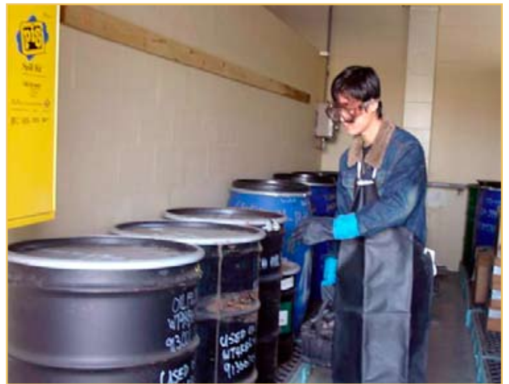
Kyung Pook National University student intern works in the Camp Walker Hazardous Waste Storage Area. Six student interns were able to earn college credit while volunteering a total of 1,990 hours with the environmental staff.

USAG Daegu's Environmental Quality Team is committed to improving environmental quality not only for the benefit of the garrison's mission, but also to prove that the installation and the U.S. Department of the Army is a good steward of the host nation's land. In FY 2006 and FY 2007, implementing the Qualitative Recycling Program, upgrading the garrison storage tank system, installing a new vehicle painting system and managing hazardous wastes more efficiently garnered significant savings, both in terms of financial costs and mitigating harmful impacts to the environment. Hands-on environmental initiatives are bolstered by training and education across the garrison that extends out into the community. Through the efforts of its Environmental Quality Team, U.S. Army Garrison Daegu is demonstrating to its host nation that the Army is a good neighbor and a valuable asset in sustaining the environment in Korea.