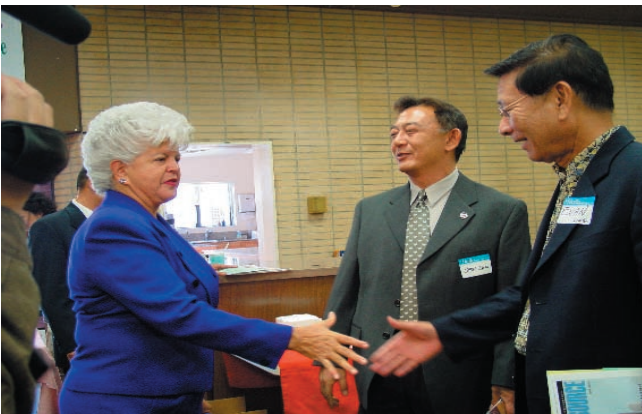
Congresswoman Napolitano Discusses Concerns of Taiwanese-Americans at Town Hall Meeting

The Congresswoman discussed keeping the peace between China and Taiwan and improving trade relations. She focused on assistance for small business, the importance of Social Security, the cost of the War in Iraq and the rising cost of gasoline.