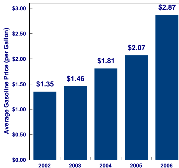
Figure 2: New Jersey Gasoline Prices Have Increased For Four Straight Years

New Jersey gasoline prices have now increased for four consecutive years. In May 2002, one year after President Bush announced his energy policy, gasoline cost an average of $1.35 per gallon in the state. Average costs increased to $1.46 in May 2003, $1.81 in May 2004, $2.07 in May 2005, and $2.87 this month. Figure 2.