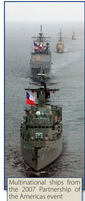
Multinational ships from the 2007 Partnership of the Americas event

Partnership of the Americas 2007. For the second year in a row, U.S. Southern Command conducted a maritime Partnership of the Americas (POA) event in our region. Evolving from the initial one-month event in 2006, POA '07 involved a six-month Navy and Marine Corps mission throughout Latin America and the Caribbean that focused on enhancing relationships with regional partners and improving operational readiness and interoperability. During the deployment, a four-ship multinational task force circumnavigated South America, participated in several multinational exercises sponsored by U.S. Southern Command, and conducted theater security cooperation and community relations events on