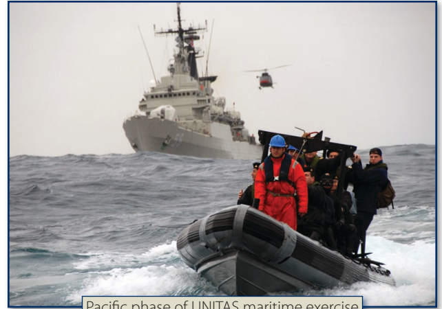
Pacific phase of UNITAS maritime exercise

Another significant exercise is our UNITAS maritime exercise program that we conduct on both the Atlantic and Pacific sides of South America. These two exercises sponsor multinational maritime forces to enhance security cooperation and improve coalition operations. UNITAS is our longest running exercise program and is coming up on its 49th year. Last year's exercises were conducted as part of our Partnership of the Americas event and trained each participant in a variety of maritime scenarios designed to practice operations within a multinational force.