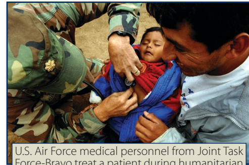
U.S. Air Force medical personnel from Joint Task Force-Bravo treat a patient during humanitarian relief efforts

In almost every case, our Joint Task Force — Bravo (JTF-B), located in Soto Cano, Honduras, was a major contributor to the success of these disaster relief operations. Essentially a small, joint air wing comprised of 18 helicopters, JTF-B is our only permanently-deployed contingency force in the region. JTF-B responds to crises as a first-responder and routinely participates in humanitarian assistance, disaster relief, search and rescue, personnel recovery, and non-combatant medical evacuations. JTF-B has a long history of answering the call for assistance and is a tremendously valuable asset to U.S. Southern Command's partnership and goodwill efforts in the region.