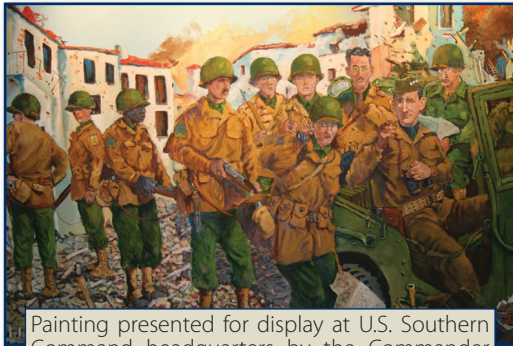
Painting presented for display at U.S. Southern Command headquarters by the Commander of the Brazilian Army depicting the Brazilian Expeditionary Force in Italy, 1944

Building Partnership Capacity. Throughout U.S. history, our nation has depended upon external partners to help maintain our own security and to spread the benefits of security and stability to ensure a cooperative worldwide economic system. This is true now more than ever, as today's transnational security threats cross borders, use distributed networks, and leverage information technology to threaten peace-seeking nations worldwide.