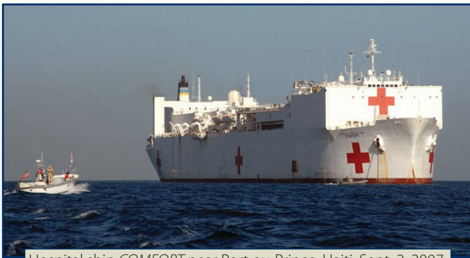
Hospital ship COMFORT near Port-au-Prince, Haiti, Sept. 2, 2007

initiative was the deployment of the hospital ship COMFORT to the Caribbean, Central America, and South America. For four months last summer, this unique ship — with its specially tailored joint, interagency, international, and private sector crew — traveled to 12 countries in Latin America and the Caribbean to bring modern medical care to almost 100,000 men, women, and children through nearly 400,000 patient encounters. This symbol of goodwill brought renewed hope to those who might have