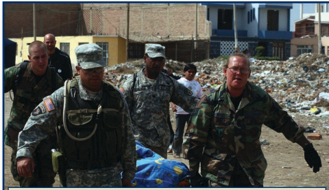
Joint Task Force-Bravo medical support to Peru after an 8.0 magnitude earthquake

to a Nicaraguan request for relief following Hurricane Felix in September, arranged the procurement of firefighting equipment for Paraguay during a widespread wildfire also in September, and assisted the Dominican Republic after Tropical Storm Noel ravaged the island nation in October.