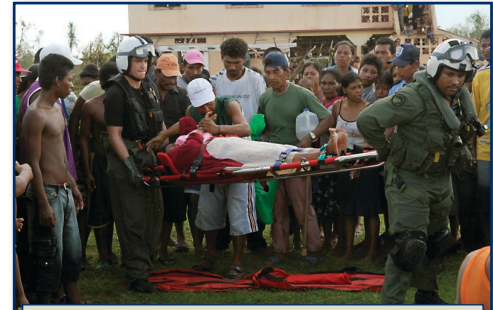
Disaster relief to Nicaragua after Hurricane Felix

alleviate the suffering of many and assisted affected regions in their recovery. Specifically, we provided much needed flood relief to Bolivia in March, and quickly provided relief to Peru following an earthquake in August. Also in August, we assisted Belize after the passage of Hurricane Dean. We were critical first-responders