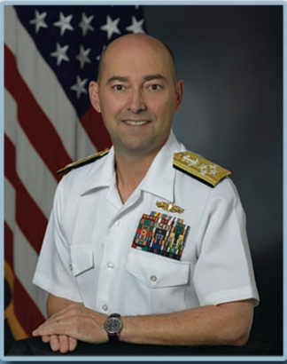
Jim Stavridis Admiral, US Navy Commander