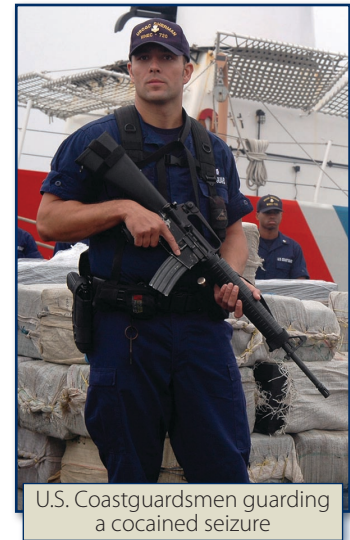
U.S. Coastguardmen guarding a cocained seizure

U.S. Southern Command's unique counter-narcotics task force located in Key West, Florida, is a role model for the kind of innovative cooperation and fusion of capabilities we need to counter this dynamic and pernicious threat. This Joint Interagency Task Force South (JIATF-S) combines the efforts of international partners, the U.S. armed services, and numerous U.S. and international departments and agencies, including Panama Express , an interagency Strike Force of the Organized Crime Drug Enforcement Task Force (OCDETF) supported by the Department of Justice dedicated to maritime interdiction originating in Colombia and related investigations. Thanks to this cooperative and effective arrangement, large quantities of narcotics moving through the region are interdicted each year. Last year this task force stopped approximately 210 metric tons of cocaine from entering the United States and facilitated the capture by law enforcement or partner nations of hundreds of drug traffickers. These efforts prevented the equivalent of roughly one billion cocaine hits from reaching our streets. More must be done, however. Drug traffickers respond to pressure by changing their tactics, as well as by diversifying their markets, such as in Europe and beyond, thereby compounding the global drug problem. JIATF-S has an outreach plan that includes interaction with European law enforcement agencies and liaison with most of the U.S. geographic combatant commands.