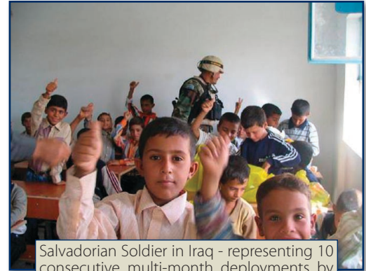
Salvadorian Soldier in Iraq - representing 10 consecutive multi-month deployments by El Salvador to Iraq

with these partners and flexibly expend resources to build overall regional security capability and capacity. Just as important, we need to be able to rapidly address capability shortfalls with key partners to meet emerging transnational threats.