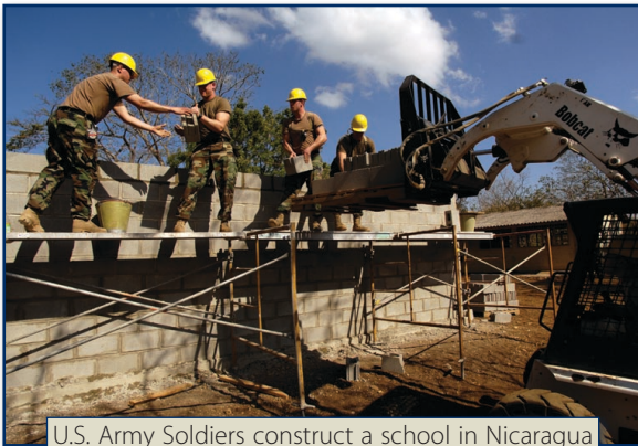
U.S. Army Soldiers construct a school in Nicaragua during a New Horizons exercise

Humanitarian Assistance. Throughout the year, U.S. Southern Command's Humanitarian Assistance Program augments traditional military-to-civilian engagement activities in order to increase our partner nations' ability to respond independently to natural and man-made disasters. Our program helps local populations who could benefit from completed projects such as schools, clinics, community centers, orphanages, emergency operations centers, disaster response warehouses, wells, and potable water systems. Last year we completed 49 construction projects and provided critical training programs for first responders, disaster managers, firefighters, and disaster warehouse managers.