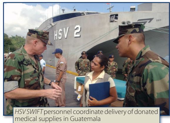
HSV SWIFT personnel coordinate delivery of donated medical supplies in Guatemala

The focus of the HSV SWIFT deployment was to train local security units on port security operations, small boat operations and repair, and small unit tactics. This floating theater security cooperation platform hosted more than 1,000 military and civilian personnel and