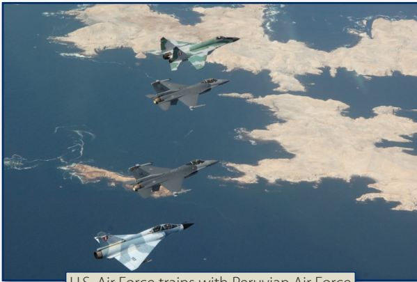
U.S. Air Force trains with Peruvian Air Force

the capability and capacity of our partners to respond to mutual security threats — either independently or with regional partners.