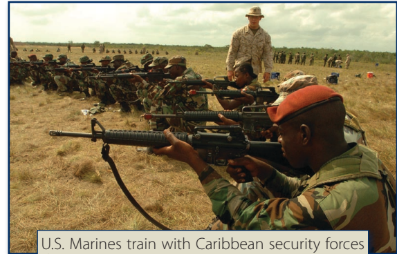
U.S. Marines train with Caribbean security forces during TRADEWINDS exercise

We also conducted a multinational exercise — TRADEWINDS — that focused on transnational threats in the Caribbean Basin. This successful exercise brought together security forces and interagency personnel from 18 nations to practice coordinated first-responder, fire, police, and military responses to security threats. The exercise scenario emphasized basic security operations, counter-drug activities, and disaster preparedness in a field environment with a focus on regional cooperation.