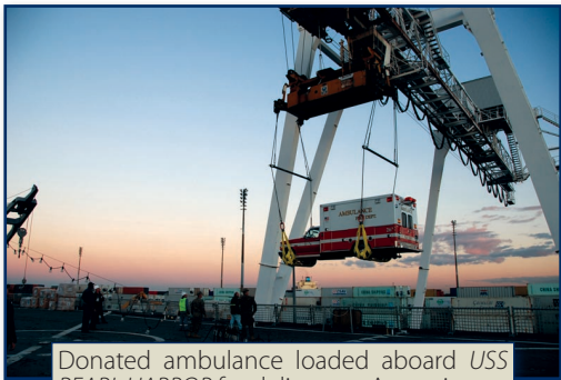
Donated ambulance loaded aboard USS PEARL HARBOR for delivery to Argentina

Fortunately, we already have significant interagency integration at U.S. Southern Command. Over the last year, we created a directorate designed to foster collaboration with interagency partners. We have exchanges, liaisons, and/or representatives from 17 federal agencies and departments that participate in our planning efforts and help coordinate command activities. We have hosted extremely successful interagency conferences, exercises, and coordination group meetings on a number of strategic topics