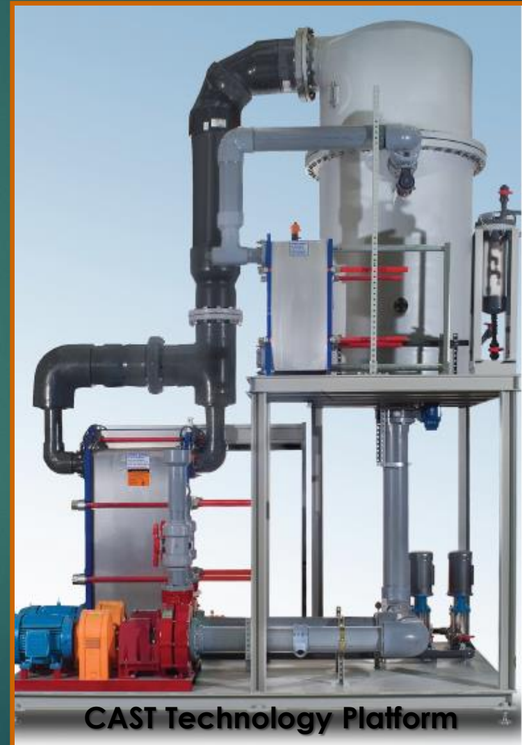
CAST Technology Platform