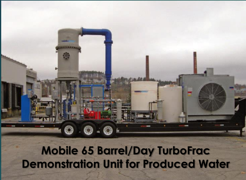
Mobile 65 Barrel/Day TurboFrac Demonstration Unit for Produced Water