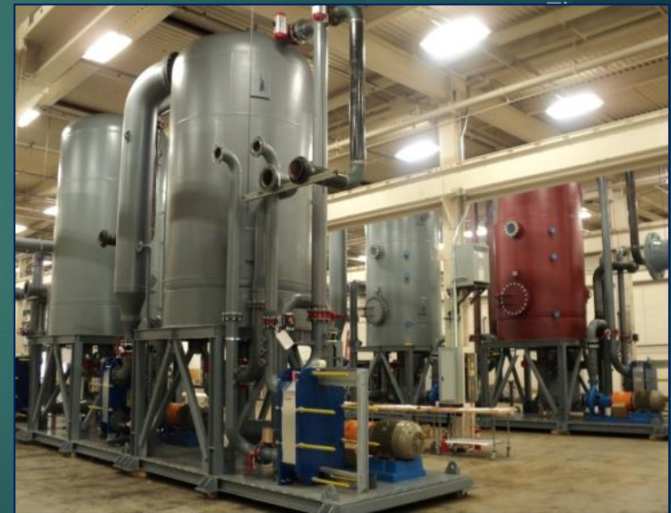
ThermoEnergy Staged CAST System