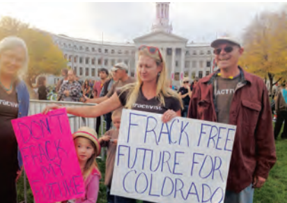
Frack Free Colorado

International mining giant Anglo American withdrew from the proposed Pebble Mine project in mid-September, dealing a major blow to a mine that would exploit a vast swath of American wilderness and cause irreversible damage to the world's largest wild salmon fishery. To convince Anglo American to walk away and to gather the support needed to stop Pebble, we worked with a diverse group of partners, including local tribes, investors, jewelers, electronics companies and supermarkets. The fate of the mine is now in the hands of the EPA, which has the authority under the Clean Water Act to stop the mine once and for all.