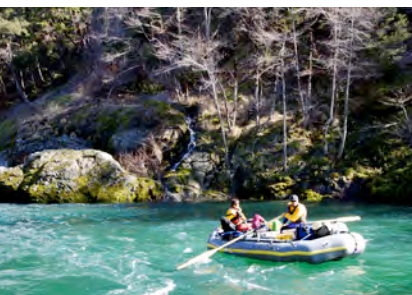
Northwest Rafting Co.

Earthworks is proud to support communities' right to control their future, including saying no to drilling or fracking. In Colorado, a state that has known the impacts of fracking for decades, we helped bring experts to public forums and to court to present the facts and dispel fiction. Winning at the ballot box is no small feat, and the Colorado towns that demanded bans aren't just protecting their own communities, they're setting an example and a precedent for communities from California to Texas to New York to do the same.