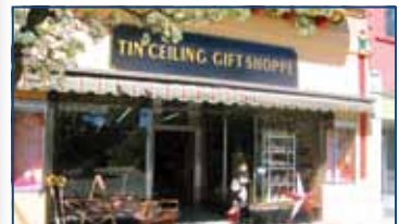
Tin Ceiling Gift Shoppe 51 Main Street • Bradford, PA