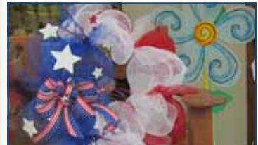
Moments to Remember 62 Main Street • Bradford, PA