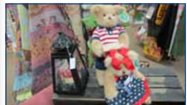
Timeless Treasures 10 Chestnut Street • Bradford, PA