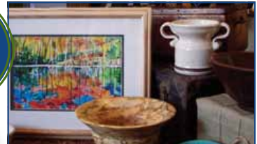
Artworks at the Depot 1 South Fraley Street • Kane, PA