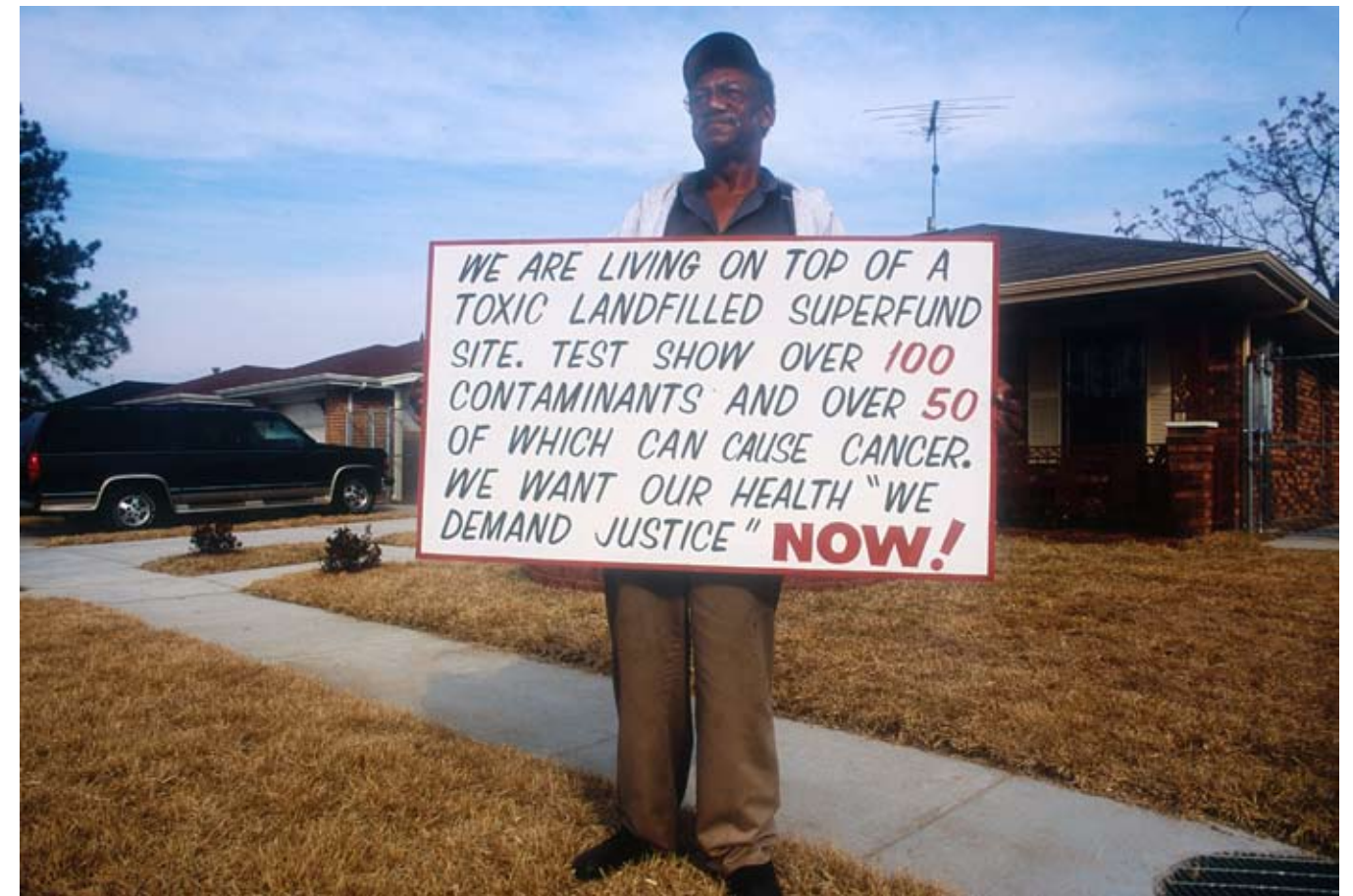
For many of the residents, the value of their homes has plummeted. Many will never find a buyer.