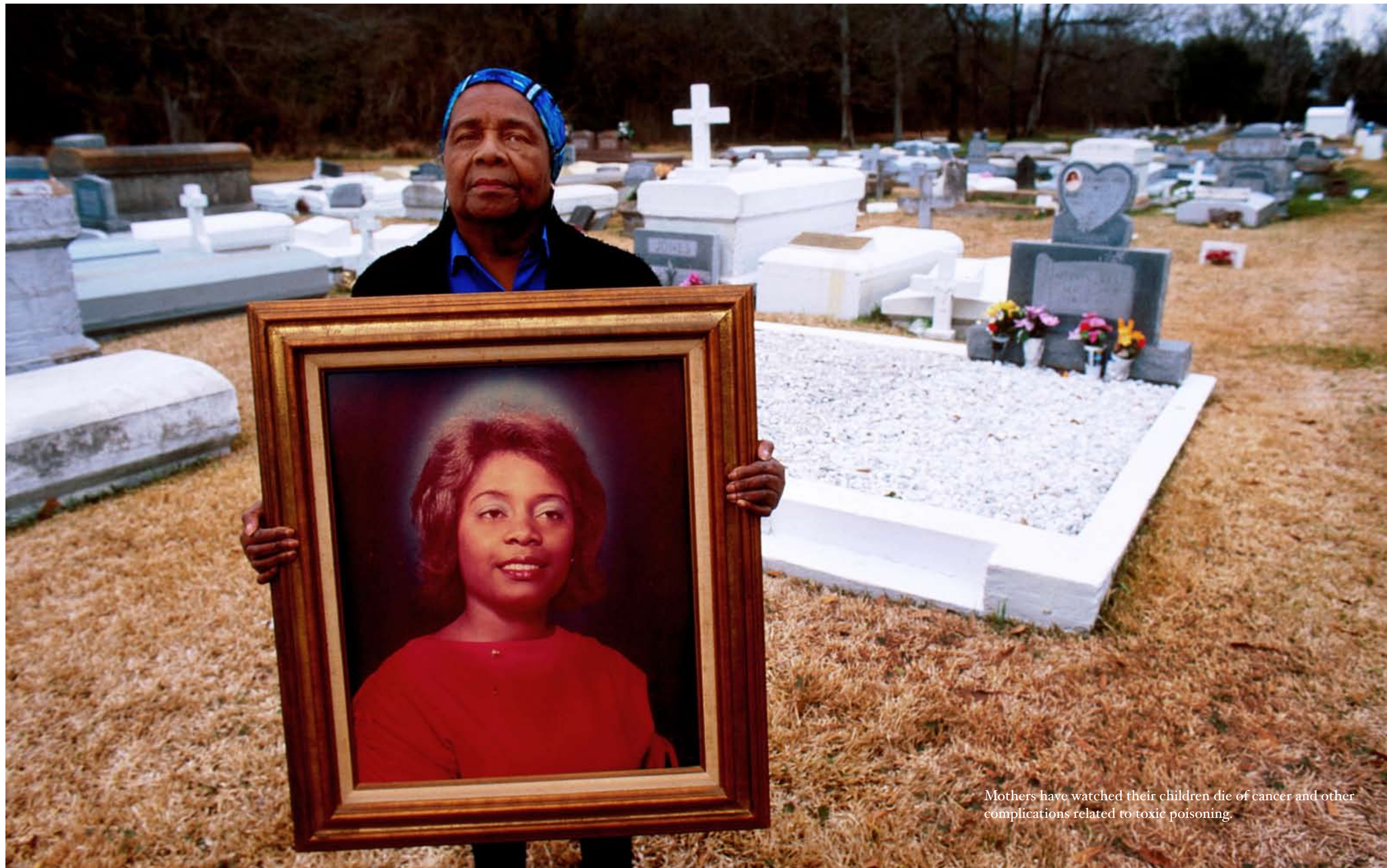
Mothers have watched their children die of cancer and other complications related to toxic poisoning