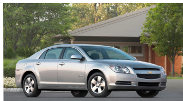
Cars: 90% pollution control