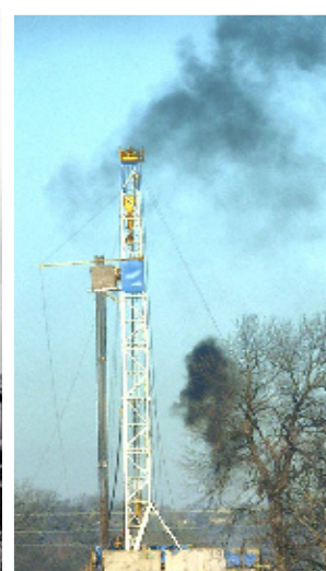
Gas Facilities 0%

Tell the State: Get as Tough on Industry as you've been on my Car at the First Meeting on DFW Smog in Four Years