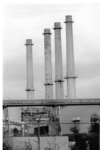
Cement Kilns 40%