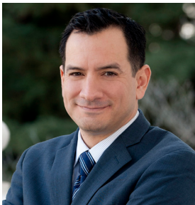
Assemblymember Anthony Rendon