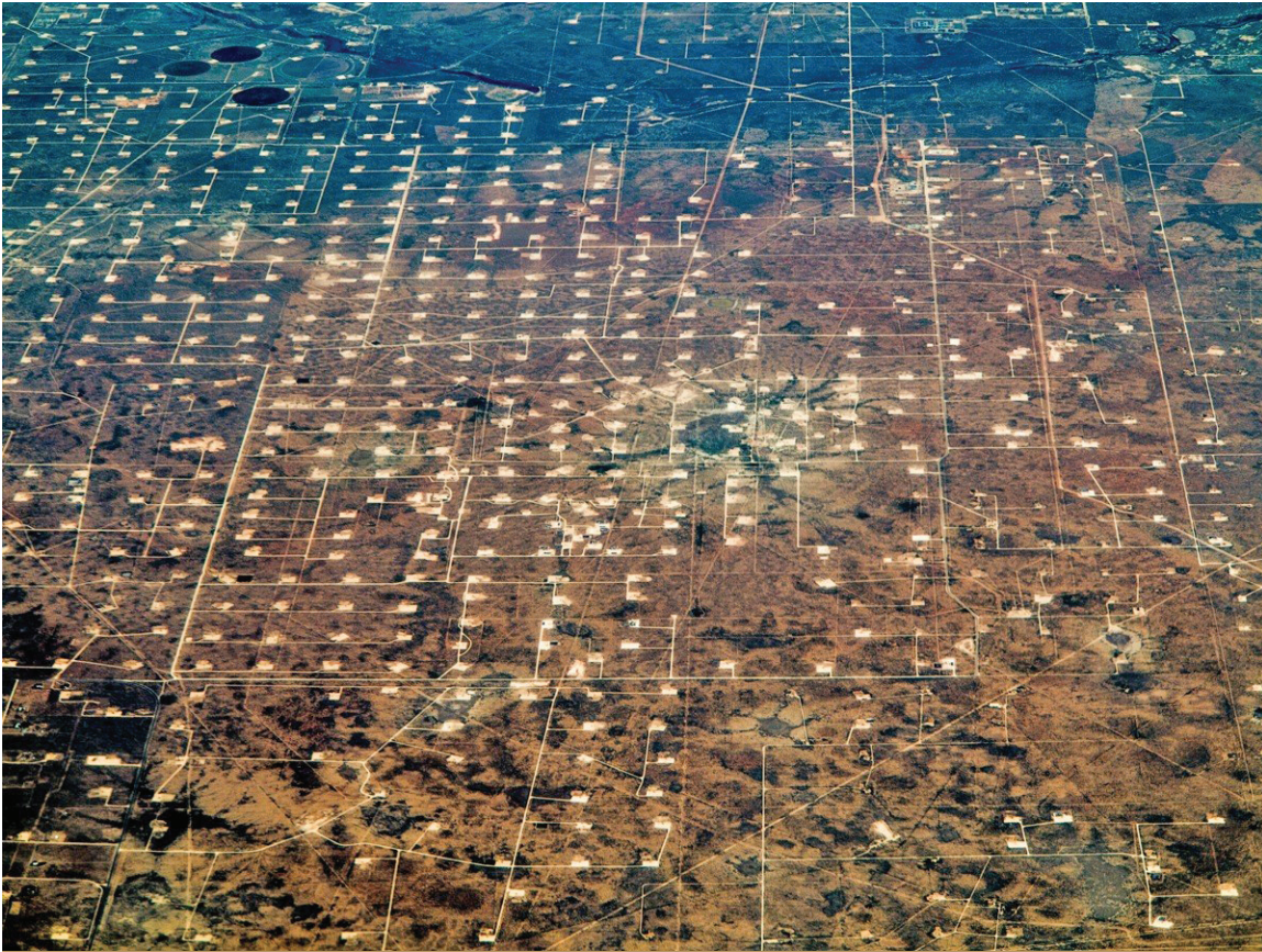
A grid of drilling sites and roads, similar to those used in fracking, lies across the landscape near Odessa, Texas.

In the years to come, fracking may affect a much bigger share of the landscape. According to a recent analysis by the Natural Resources Defense Council, 70 of the nation's largest oil and gas companies have leases to 141 million acres of land, bigger than the combined areas of California and Florida. 113 More-