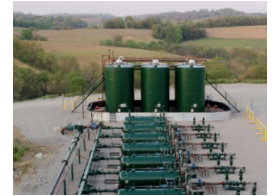
New York failed to inspect three out of every four active wells in 2010.

The Division of Mineral Resources does not currently have a database for the information requested...We are preparing to have one in operation at the time high-volume hydraulic fracturing activities are approved to go forward in the state. We do have paper records located in the field offices where the proposed wells were drilled. The record [sic] are filed by county, operator and by well name. You can review the paper records at our ... offices. 5