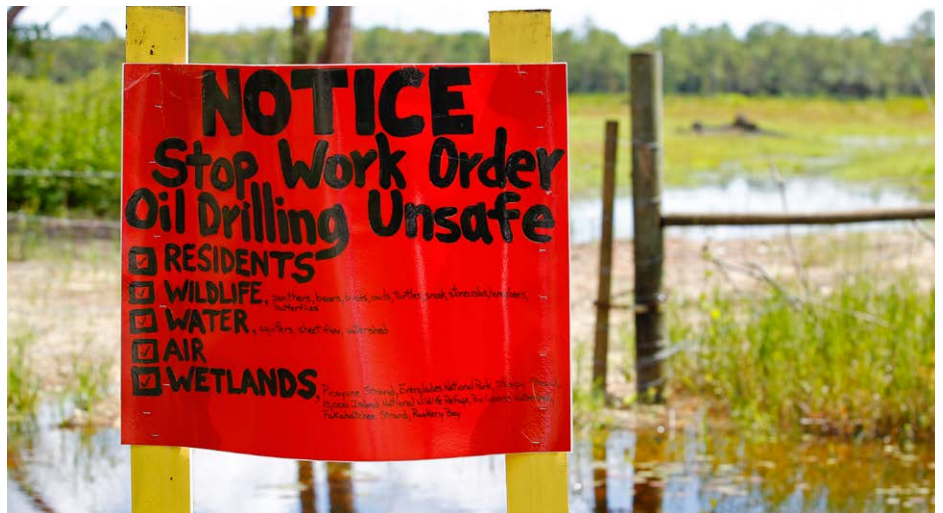
SIGN OF THE TIMES: An approved plan to drill adjacent to a Naples neighborhood near the Davidsons prompted one resident to put up a sign in protest at the site.

D.R. Horton, the biggest U.S. homebuilder, is a heavy user of the practice. The Fort Worth, Texas, company has separated the mineral rights from tens of thousands of