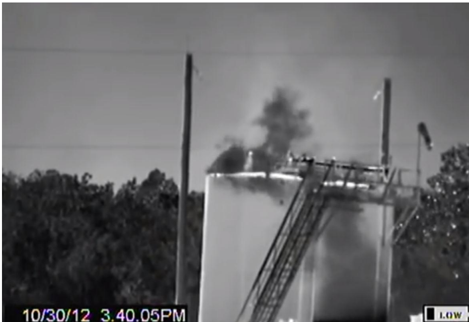
Still image from FLIR GasFindIR video taken adjacent to Delga Park in Forth Worth, Texas. Note the plume of volatile emissions venting from the top of the produced water tanks.

Video of emissions from natural gas development equipment adjacent to children’s play areas was produced using a FLIR ThermoCAM GasFindIR HSX. This equipment allows visual observation of emissions not normally visible to the human eye. While it does not provide quantitative results, the resulting video is dramatic, useful in educating the public and decision makers about the potential risk of such emissions. The FLIR equipment also allows for the identification of natural gas equipment that is leaking or otherwise emitting large quantities of volatiles, which can then be reported to the responsible companies or regulatory agencies, or to identify locations for further air sampling.