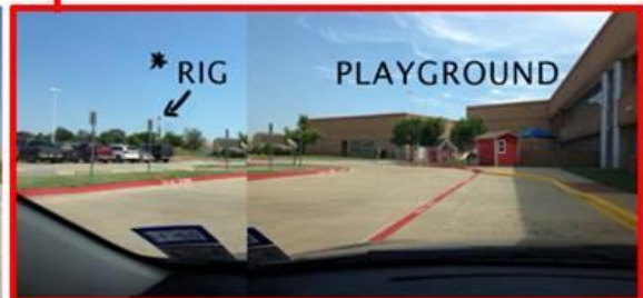
BEN BARBER SCHOOL - DAYCARE/PLAYGROUND