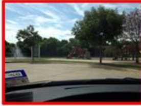
PIEDMONT DR. PLAYGROUND