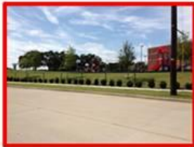
NANCY NIEL ELM. PLAYGROUND