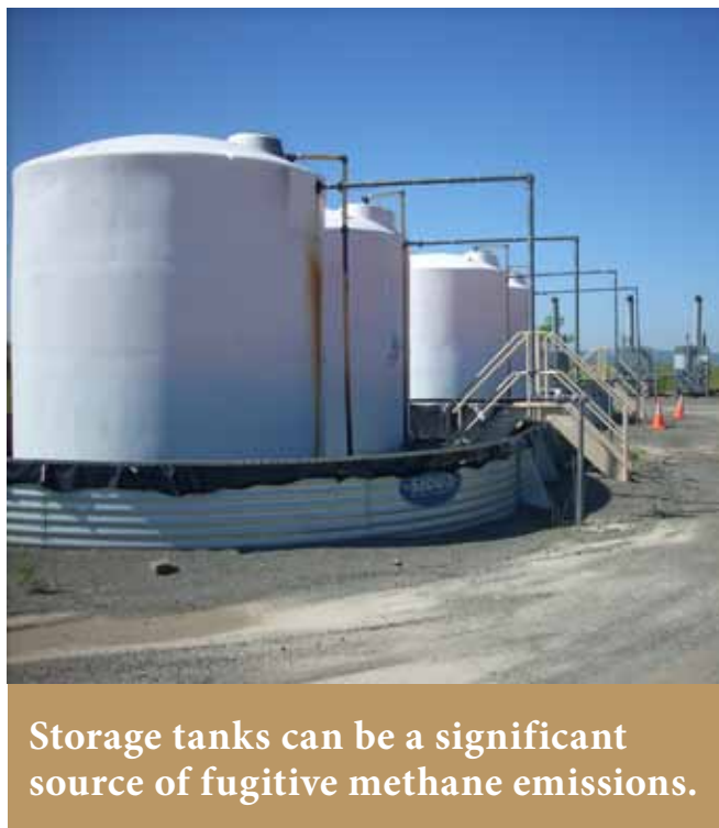
Storage tanks can be a significant source of fugitive methane emissions.