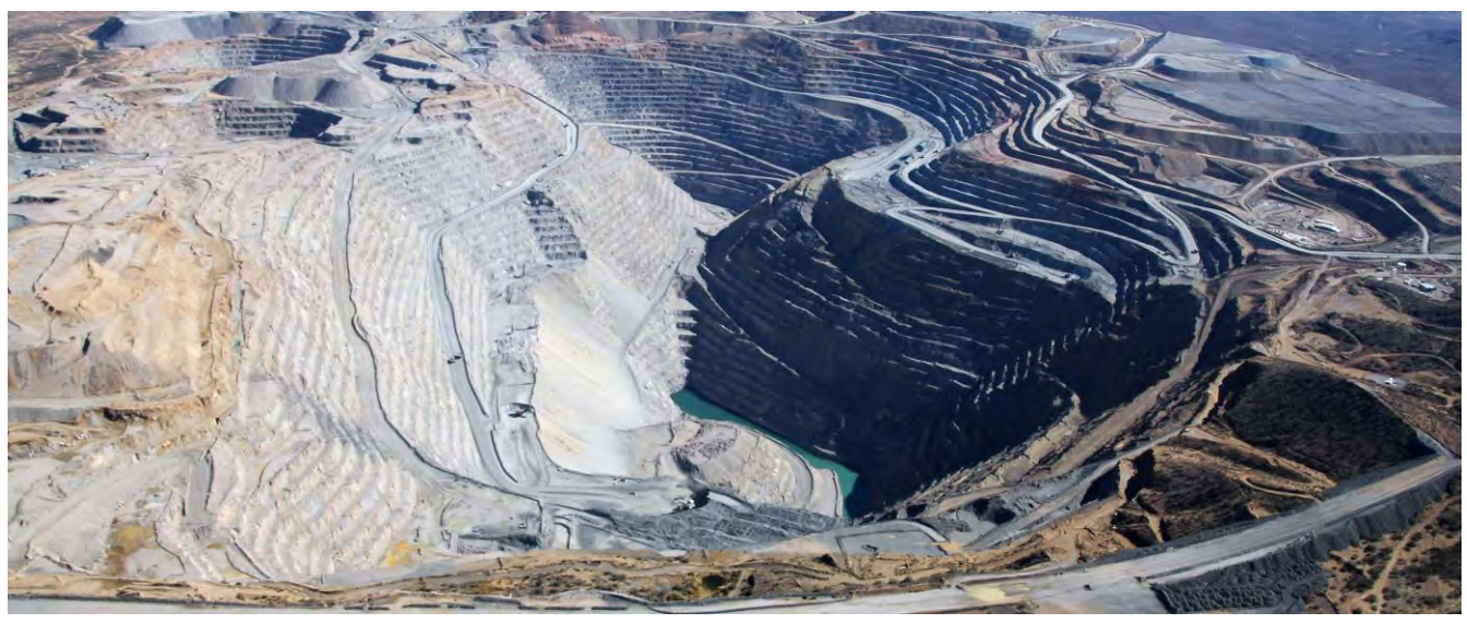
The Sierrita Mine in Green Valley, Arizona, a large mine with a long history of adverse groundwater impacts. See page 18 of Earthworks' U.S. Copper Porphyry Mines report.38

It is important to understand that although the SAP planning area covers two main deposits from which baseline data will be gathered; the Carache Canyon Deposit and the Lukas Canyon Deposit, Santa Fe Gold's emphasis at this time is Carache Canyon, and is therefore the basis of this report. The SAP states (p. 9) that "The current plan proposes to develop the Carache deposit as a conventional open pit mine" and makes no similar statements about Lukas. Although a Preliminary Economic Assessment (PEA) may be released to the public soon that includes financial scenarios for mining both deposits simultaneously and sequentially (with Carache first), as well as only mining Carache, it is too early to tell what the preference will be in a final Plan of Operations. When publicly available, the PEA may help shed some light on what path forward the company may take, though at the time of this writing, Santa Fe Gold has refused to release the PEA despite several attempts to obtain it (most mining companies release PEA's to the public immediately after completion). Additions to this report will be essential if development of Lukas seems likely, or if resources become available to study that deposit in as much detail as Carache.