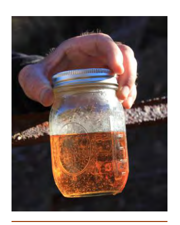
Acid mine drainage and metals leaching could permanently contaminate groundwater. This sample, heavy in iron and other metals, is highly acidic and was collected from a small Arizona mine.

Acid Mine Drainage and Metals Leaching, or AMD & ML (but usually referred to as simply AMD), is perhaps the most significant environmental problem facing hardrock mining operations. AMD is triggered by the oxidation of sulfide minerals when recently unearthed rock is exposed to air and water. This exposure causes sulfuric acid to leach from waste rock, tailings, pit walls and other areas where the surface is disturbed, exposing the sulfide minerals. The result is increased acidity in surface and groundwater, which then leaches metals from surrounding rock and further contaminates waters. Common heavy metals leached from AMD can include iron, arsenic, copper, cadmium, lead, mercury, nickel, cobalt, chromium and manganese, among others. This poses surface and groundwater contamination problems, but in the case of the Ortiz Mine, if it becomes a problem, would generally be a groundwater issue as perennial streams do not exist in the area.