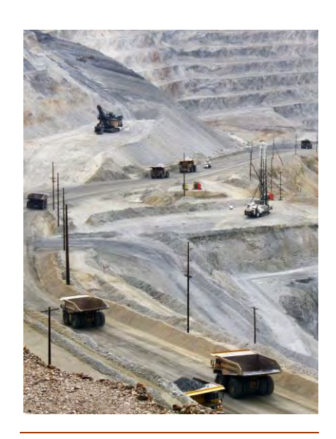
The proposed mine may burn more than three million gallons of diesel fuel per year.

Mine-specific diesel consumption data is difficult to obtain, but according to the Donlin Gold Plan of Operations<sup>29</sup>, the open pit mine – which, like Ortiz, would not use diesel fuel for electric generation – would use 40 million gallons of diesel per year to sustain a 59,000 tonne daily throughput, or 21.53 million tons per year. This equals 1.86 gallons of fuel per ton of ore milled. Applied to Ortiz, this would result in annual diesel fuel consumption of roughly 3 million gallons per year. However, because the stripping ratio at Ortiz is higher (8.5 versus about 5.5), diesel consumption will likely be higher per unit of milled ore than Donlin, as more rock must come out of the pit in order to mill the same amount of ore.