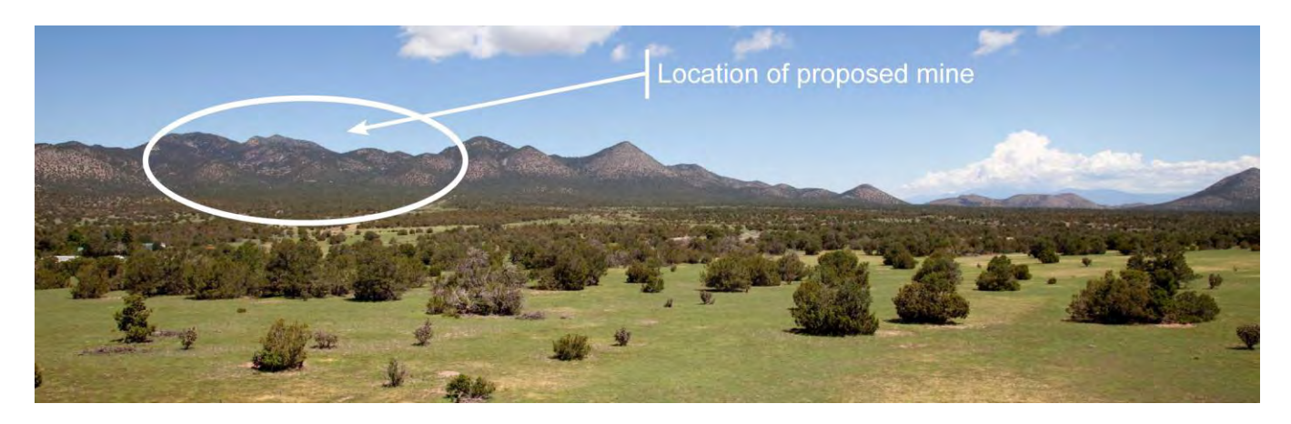
Location of the proposed mine, looking north.