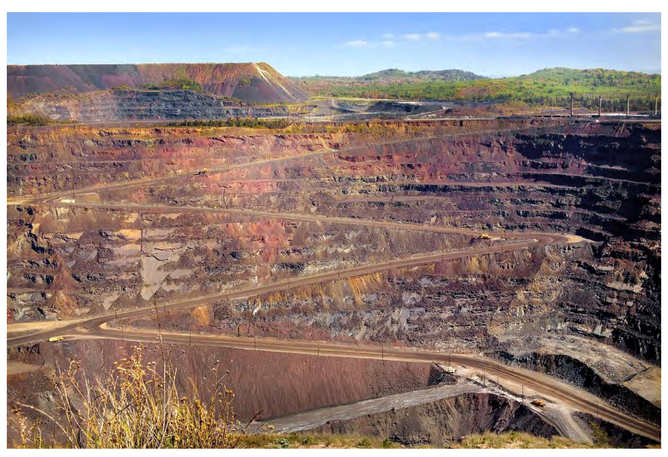
1,200 foot deep pit, comparable in depth to the proposed Carache pit's north side.

Below: a 1,200 foot deep pit (source<sup>7</sup>), comparable in depth to Carache's north side.