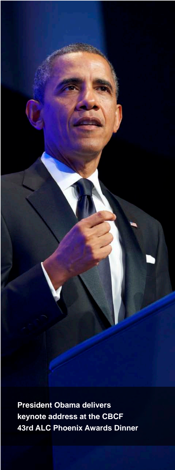
President Obama delivers keynote address at the CBCF 43rd ALC Phoenix Awards Dinner