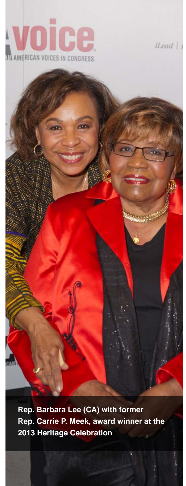
Rep. Barbara Lee (CA) with former Rep. Carrie P. Meek, award winner at the 2013 Heritage Celebration