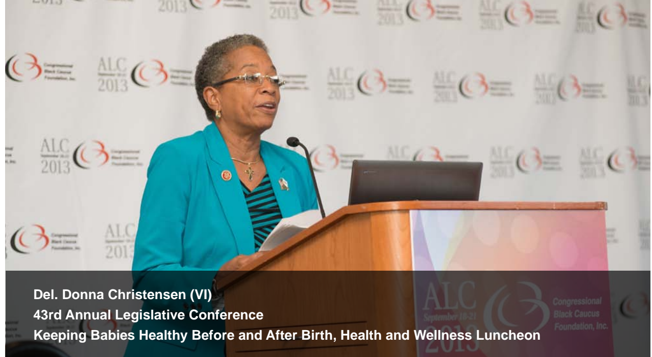
Del. Donna Christensen (VI) 43rd Annual Legislative Conference Keeping Babies Healthy Before and After Birth, Health and Wellness Luncheon