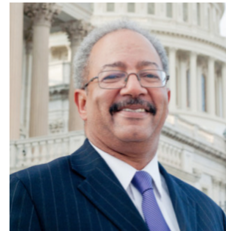
Rep. Chaka Fattah