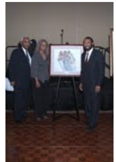
Guillory, Haitcox and Congressman Al Green