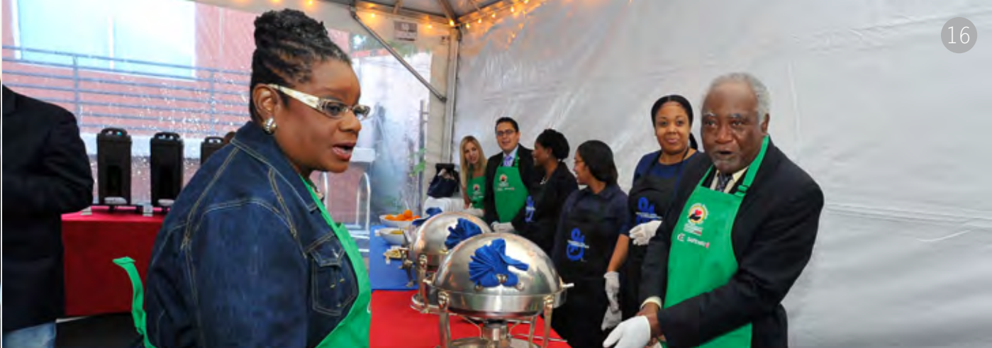
CBC Spouses Community Breakfast

The Congressional Black Caucus Foundation hosted its 7th Annual Community Breakfast and Health Fair, at the DC Community Resource Referral Center (CRRRC). The community breakfast, begun by the CBC Spouses, provided an opportunity for the Foundation, the Spouses, members of congress and corporate partners to participate in a community service event during the Foundation's Annual Legislative Conference (ALC). Breakfast was served to homeless veterans followed by free health screenings.