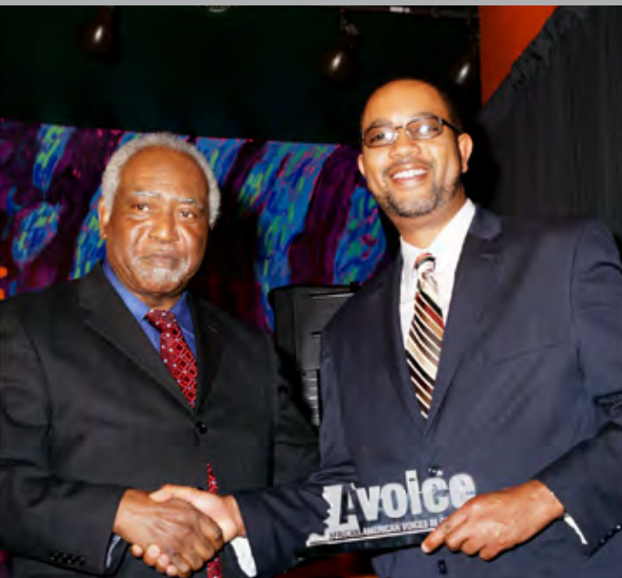
Rep. James Clyburn, Kevin Chappell (Ebony Magazine)

Avoice received more than five million hits on its web site and had 2,695 Facebook followers by the end of 2012. In addition, there was increased Avoice traffic from users in other countries including Germany, the Philippines, Norway, Nigeria, and Canada.