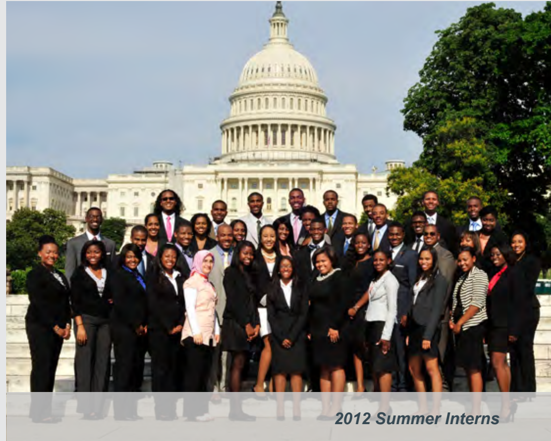
2012 Summer Interns

In 2012, the Emerging Leaders Internship Program prepared 24 young leaders with the skills necessary to generate and sustain positive change in Washington, D.C. and their local communities. The semester-long opportunity runs parallel with the Foundation's Communications Internship Program, which gives students the opportunity to work directly with the press secretary in a congressional office, congressional committee, or federal agency. Nine dynamic college students and recent college graduates took part in the Communications program in 2012. The spring semester for both internship programs includes participation in the George Washington University's Semester in Washington Program. Students earn academic credit and gain a better understanding of governing at the local, state, and national levels.