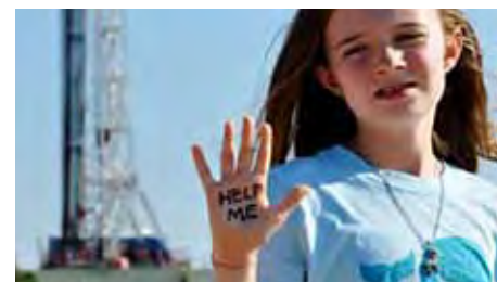
By not enforcing the rules on the books, state governments are putting communities at risk.

Earthworks released a series of trailblazing reports, Breaking All the Rules: The Crisis in Oil & Gas Regulatory Enforcement , changing how people think about the state regulation of oil and gas operations. Our reports debunked industry claims that states are the best place for government oversight. Data from six states revealed that more than half of all active oil and gas wells go completely uninspected each year and companies are seldom held accountable for violations. As a result, states have taken notice and some, like New York, Colorado and New Mexico, are beginning to take action to improve their record. Cities and towns, even in oil and gas industry-friendly states, are taking matters into their own hands to put a stop to the out-of-control drilling and fracking that threatens public health and the environment.